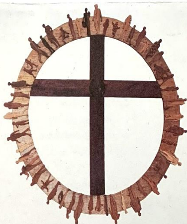
A woodcarving featured at New Carlisle Church of the Brethren.

In this season of struggle and challenge, how are you making room in your heart for God’s unfolding story? Are you opening yourself to opportunities to participate in God’s redemptive work? I am excited about the renewed possibilities of God’s story within the Church of the Brethren as we prepare for our conversation and affirmation of the compelling vision at Annual Conference, together with the Mission and Ministry Board’s new strategic plan